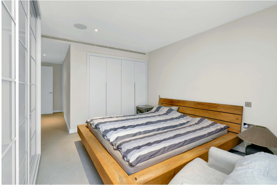
Master Bedroom with Ensuite 14' 0" x 12' 0" (4.27m x 3.66m)